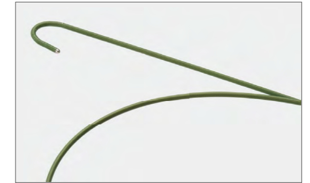
Teflon Coated Guidewire